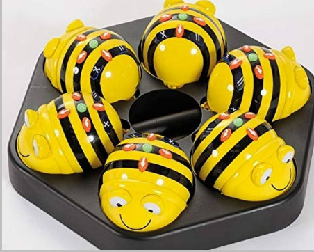
BeeBot Class Set & Mat