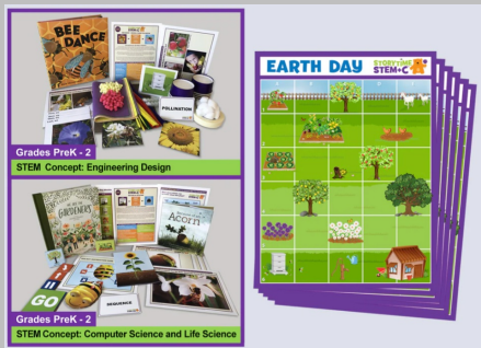
Storytime STEM Pack: Earth Day