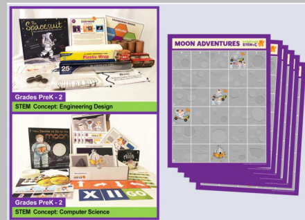
Storytime STEM Pack: Moon Adventures