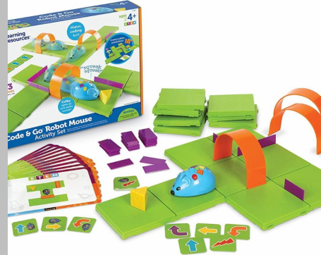
6 MouseBot Kits