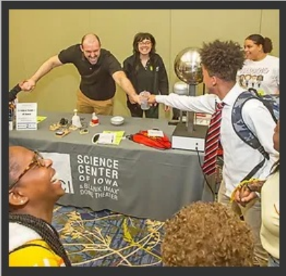
Photo from I'll Make Me a World in Iowa's 2023 website .

Educators, exhibitors, and families--please save the date for this year's I'll Make Me a World in Iowa (IMMAWII) Education Day. Within that event, the SC STEM Hub coordinates a mini-STEM fest that features diverse exhibitors and welcoming messages.