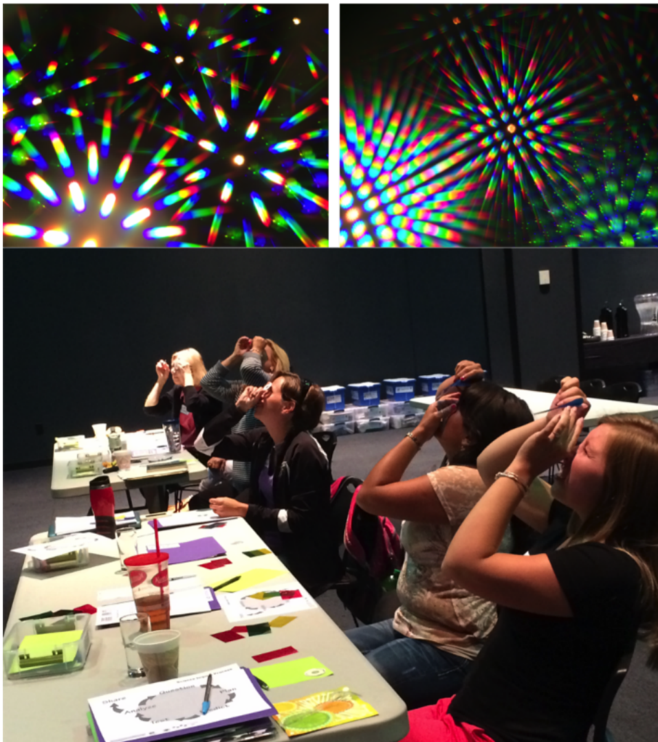
Early childhood educators discuss strategies and materials to inspire their Pint Size Scientists in STEM at the Science Center of Iowa.