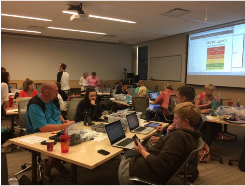
Project Lead the Way Educators attended intensive training at ISU and U of I in July for Launch, Gateway to Technology, Principles of Engineering, and Computer Science