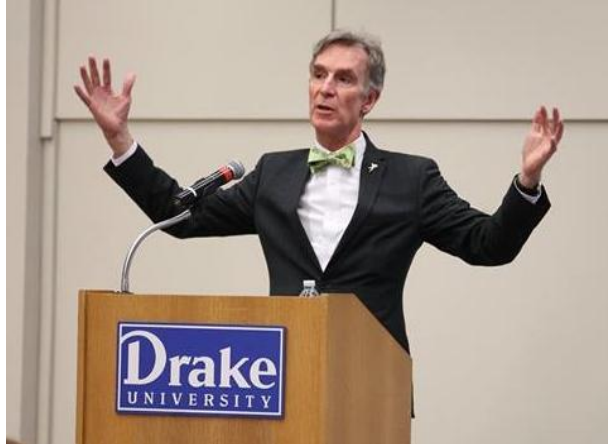
Bill Nye spoke to a packed house at Drake's Knapp Center.

The SC STEM Hub hosted a festival featured 212 exhibitors and volunteers, along with 395 festival attendees. That makes about 605 people at the Bell Center for the event.