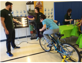
The SC STEM Region teamed up with the Northeast STEM Region to support Tama's fourth STEM festival. With over 450 attendees, the festival was a huge draw once again.