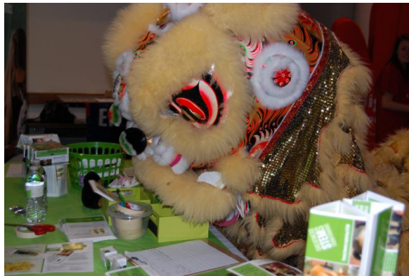
Lions love STEM! The Asian Alliance's Lion Dancers amazed festival attendees and stopped by the booth to build a tower.

Week of the Young Child (WOTYC) is an annual event that celebrates, educates and energizes the Pre-K community. This year's Saturday festival was held at Drake University's Olmstead Center on April 16. Families visited booths hosted by organizations and businesses around the community, including the SC STEM Region.