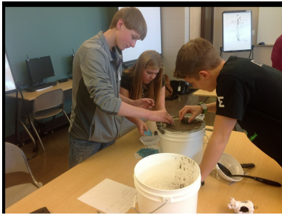
High school sophomores get hands-on engineering experience during winter break.